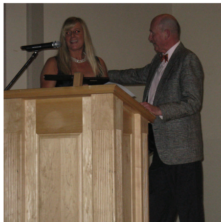
Volunteer of the Year