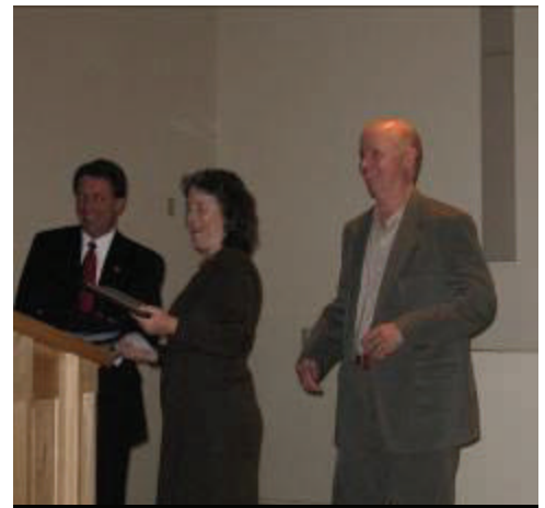
Business Leaders of the Year