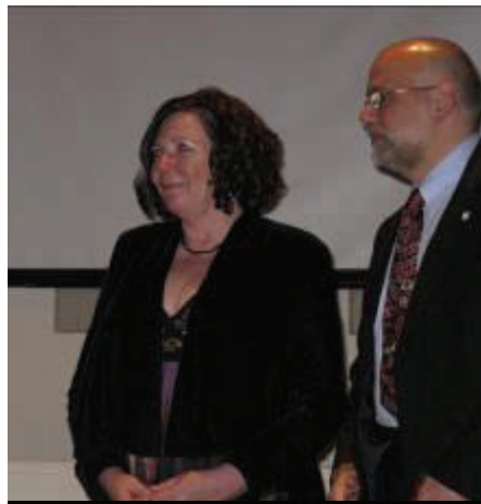
Del Norte Pride Award